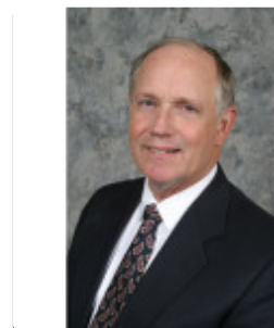
Region Governor and Former Bechtel Leader Reflects on Dream Big Journey