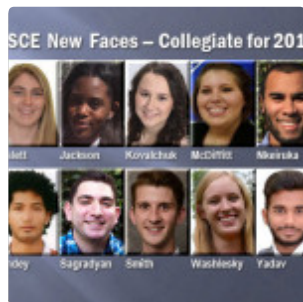
ASCE Announces 2017 New Faces of Civil Engineering – College