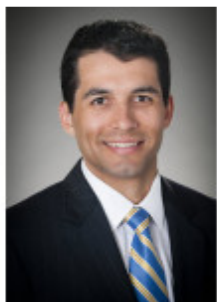
Champion of High School Outreach in Dallas a Deserving ASCE New Face